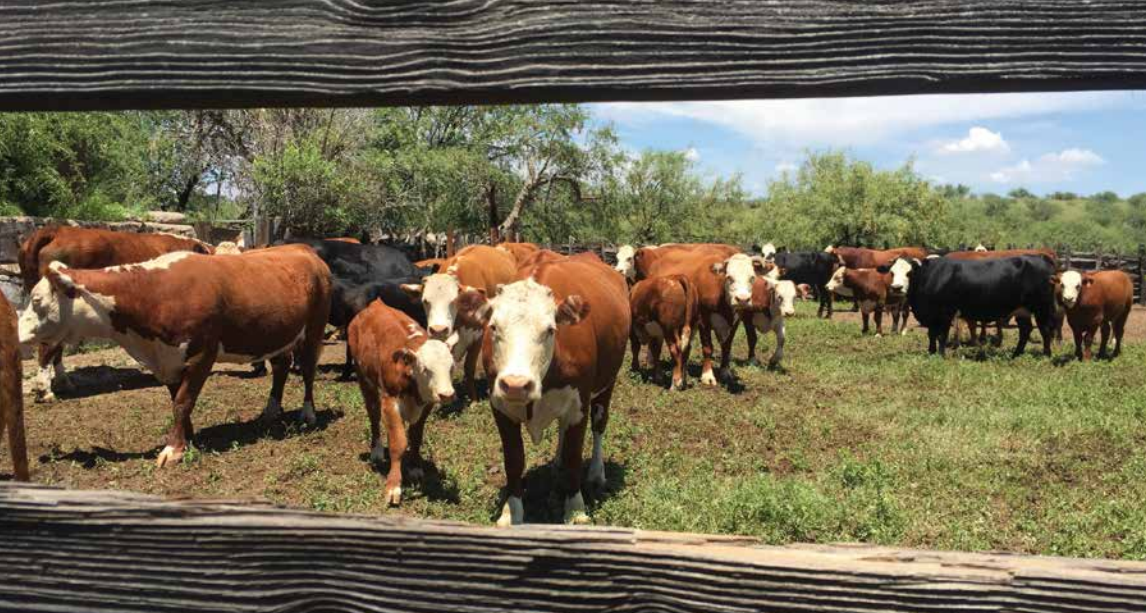
Santa Lucia