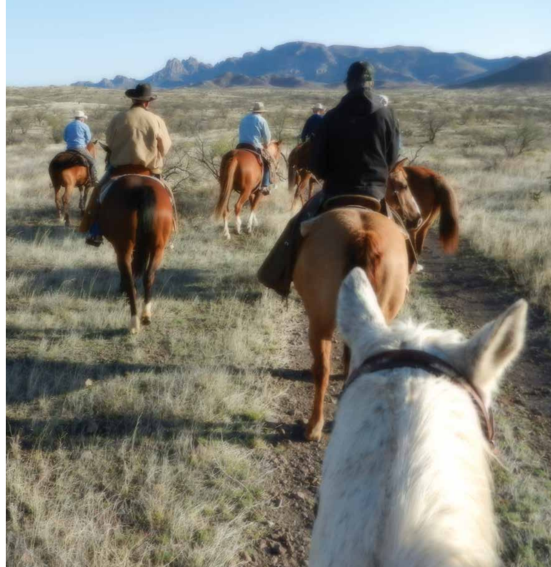
Santa Lucia